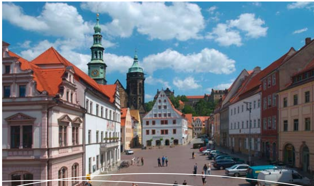
Canaletto's historic view of Pirna can still be seen in the old market square