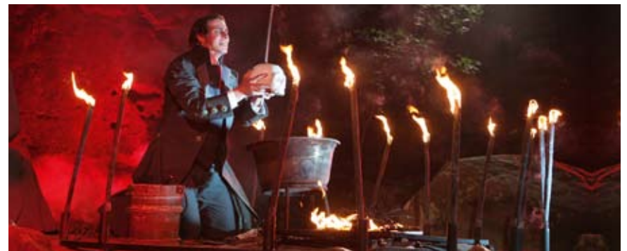
Performance of "Der Freischütz" at the Rathens' Mountain Theatre

Sebnitz was once the centre of European silk flower manufacturing. Today, this great tradition can be relived in the demonstration workshop of the "Deutsche Kunstblume Sebnitz" house and in a few other, smaller, enterprises. Visitors are invited to have a go at making flowers themselves.