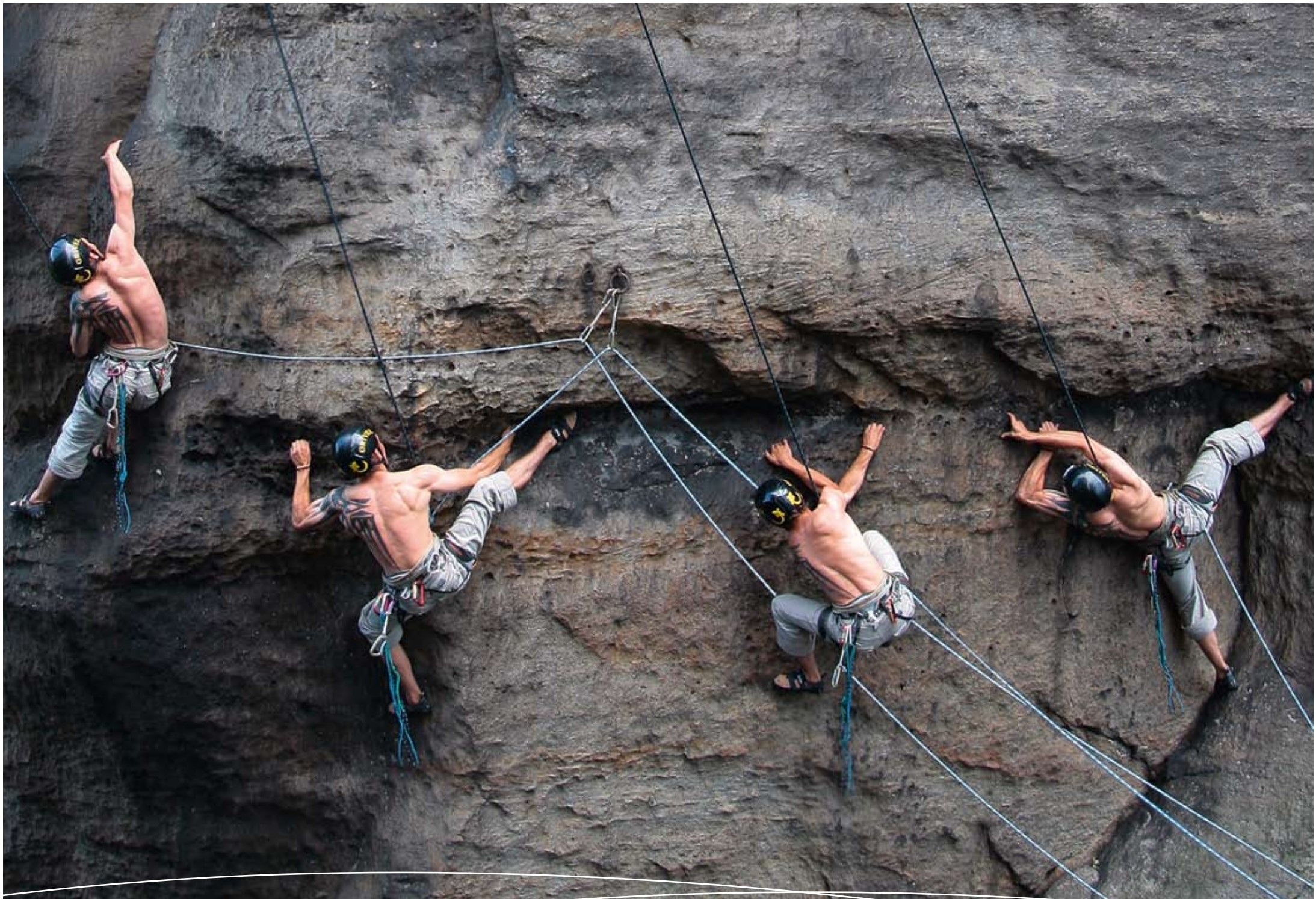
Climber in a time lapse