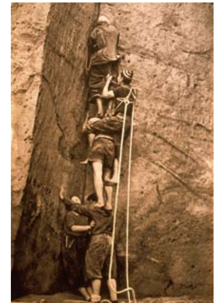
Community path at the Wilde Zinne, 1938; first ascent 8a

With few limitations (some areas have been afforded special conservation status) elite climbers come from all corners of the globe to find freestanding sandstone rocks and climbing trails of all degrees of difficulty, from I to XII.