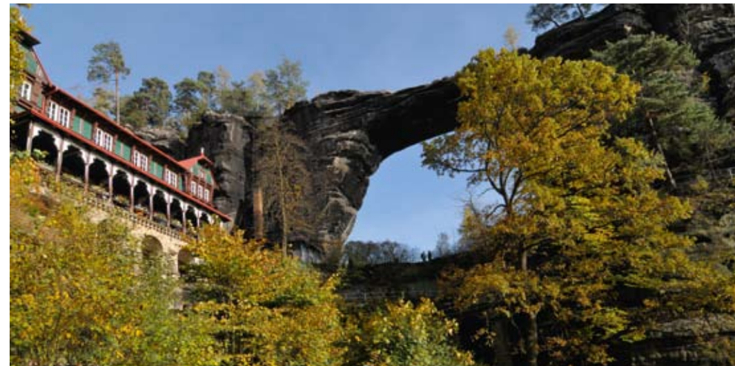
Prebischtor (Prebisch Gate)